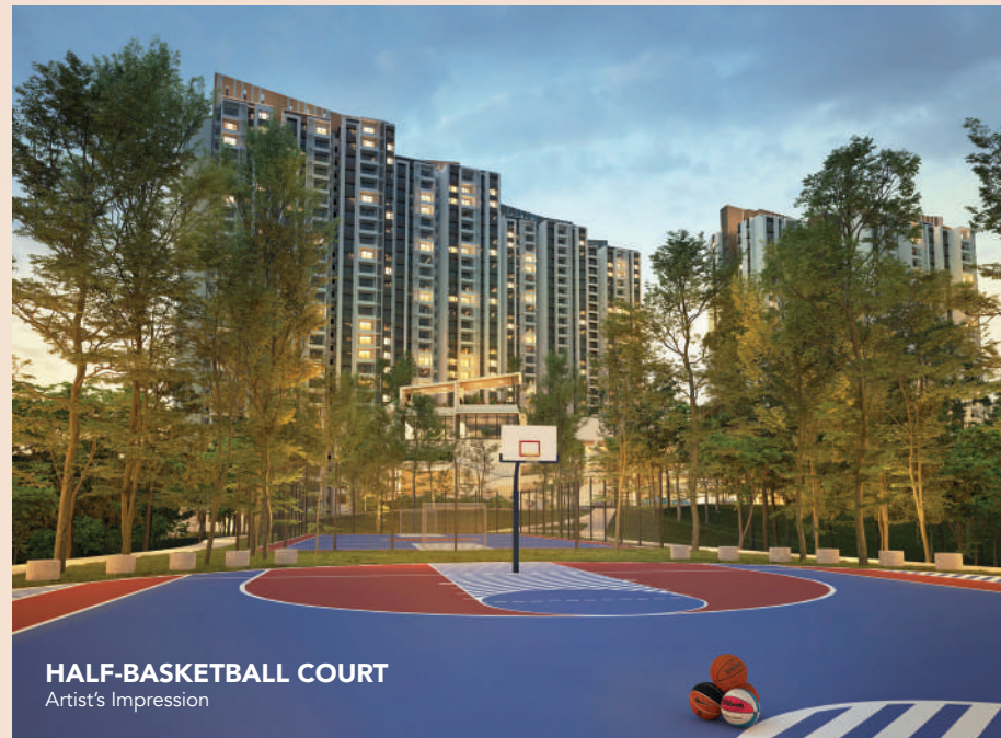
HALF-BASKETBALL COURT Artist's Impression