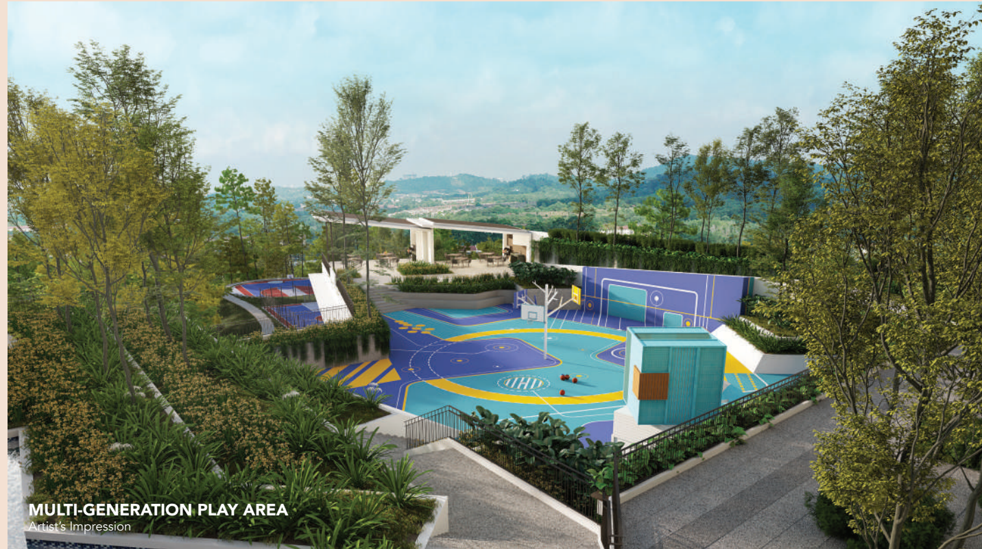
MULTI-GENERATION PLAY AREA Artist's Impression