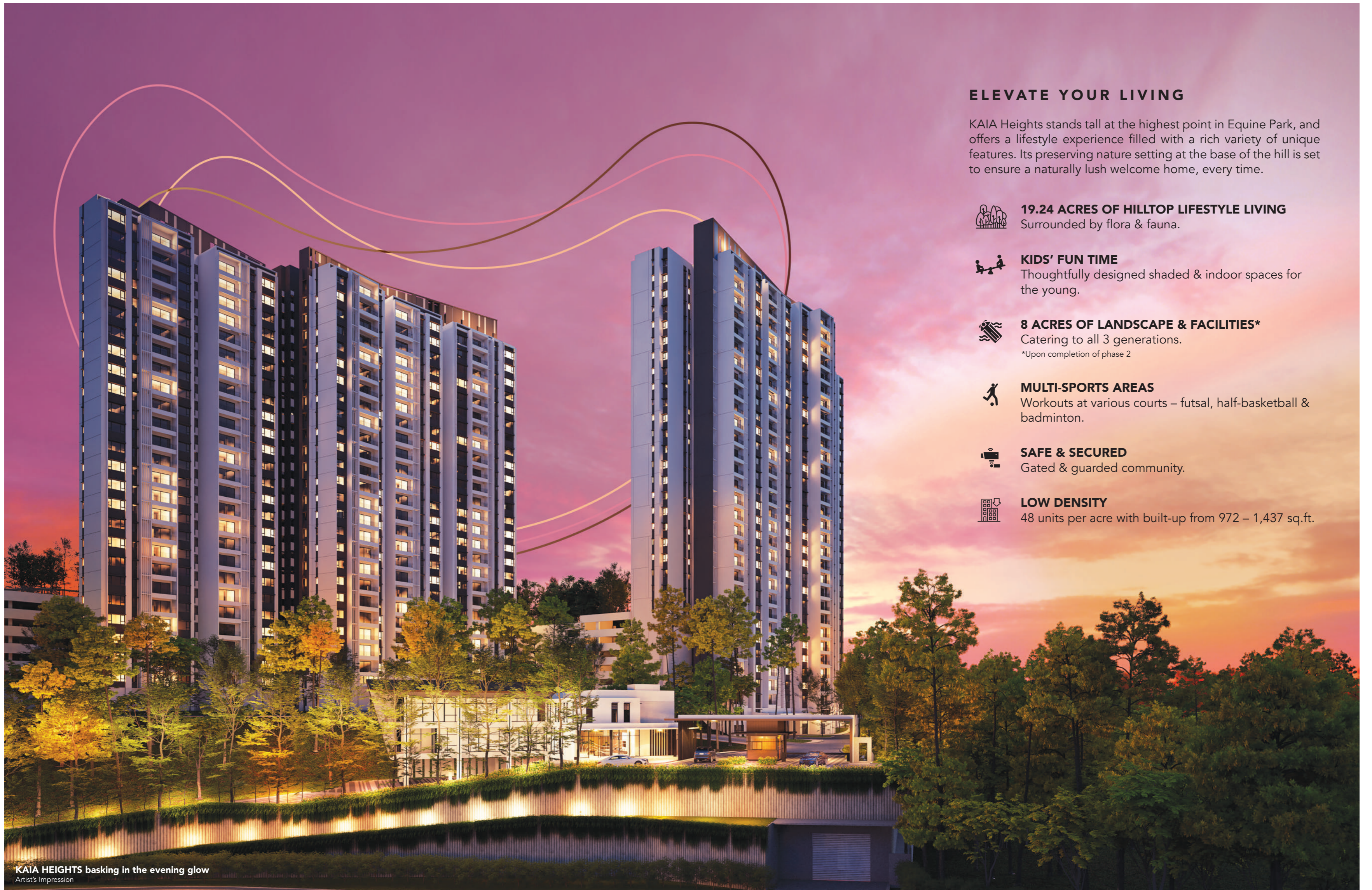
KAIA HEIGHTS basking in the evening glow Artist's Impression